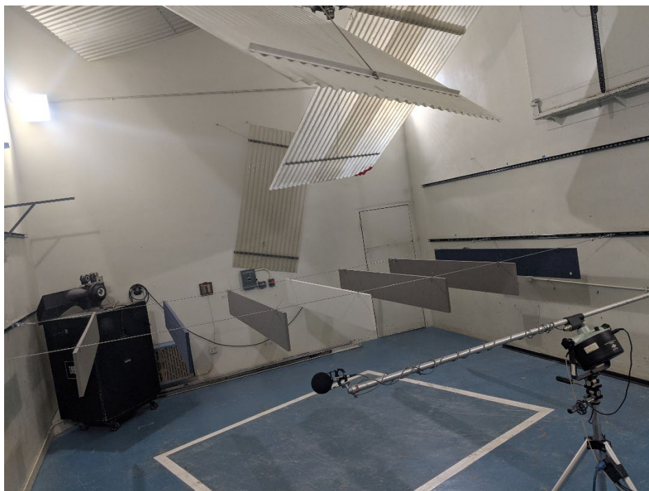
Figure 1 – Specimen mounted in test chamber